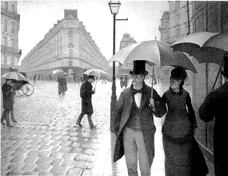
A Paris Street, Rain (1877), Gustave Caillebotte. Oil on canvas. The Art Institute of Chicago.

She gave him an irritated glance and burst out impatiently, “What do you think I have to go in?”