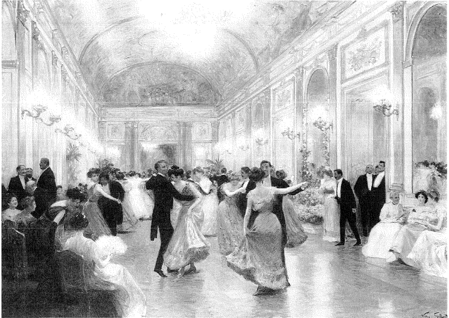
The Ball , Victor Gabriel Gilbert.

ANALYZE VISUALS In your opinion, how well does this painting reflect the setting of the party? Describe the details that influenced your opinion.