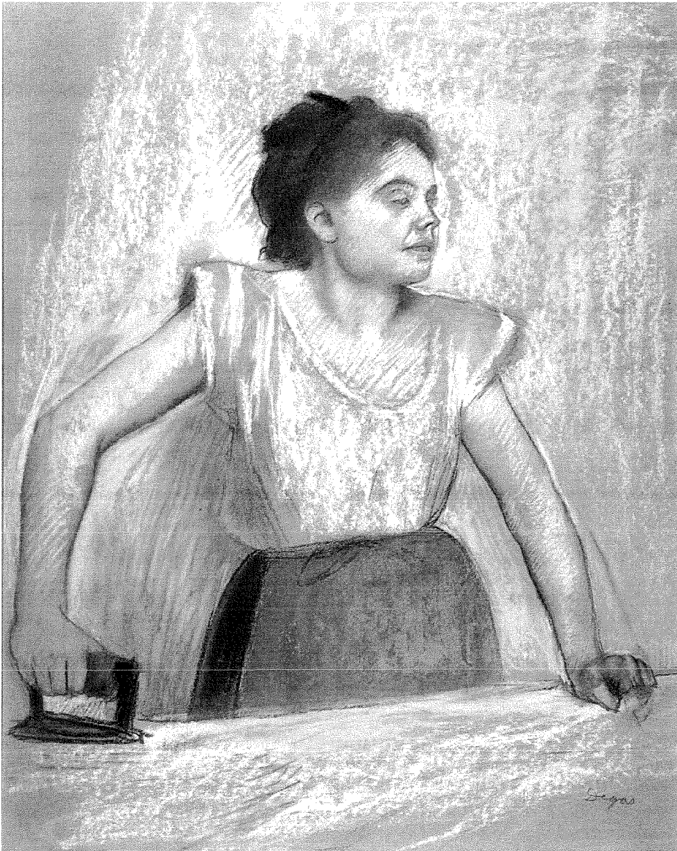
The Laundress (1869), Edgar Degas. Pastel, white crayon, and charcoal. Musée d'Orsay, Paris.